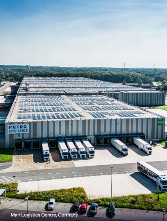
Marl Logistics Centre, Germany